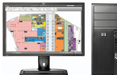
AutoCAD, AutoCAD Architecture, and other AutoCAD based applications