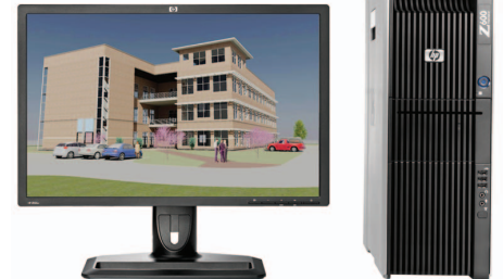
Autodesk Revit Architecture, Structure, MEP